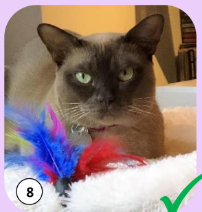
Photo number 8 is a very good one of the full face - giving the shape of wedge and muzzle, ear shape and set, eye shape, set and colour, plus the colour of the face. I find this one very useful for assessing head full-on and Burmese expression.

Photo number 7 is better than number 6 and is the correct angle to show all the elements listed in No 6.