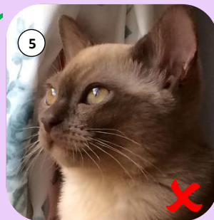
Photo number 5 wasn't helpful. The photo is slightly out of focus and the angle doesn't show the profile properly or the face/earset/wedge clearly although it was good for eye colour.

Photo number 6 is quite good at showing the profile. Ideally, I'd like the shot to be taken full-on to the