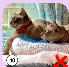
Photo number 10 is blurry and not of much help. It is hard to distinguish between the two cats, as they blend in too much.

Overall, I think a side-on photo of the body when standing is best for body shape, leg shape, tail, balance, coat and colour. A full-on face shot of the head and full-on profile shot of the head will give the detail of wedge-shape of head, ears, eyes, break, forehead and chin, all of which have a total of 45 points in the SOP.