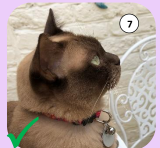
Photo number 7 is better than number 6 and is the correct angle to show all the elements listed in No 6.

profile, that way the chin, as well as nose break and length, the shape of the forehead, the depth of skull and set of the ears, would all be visible as they are in photo 7.